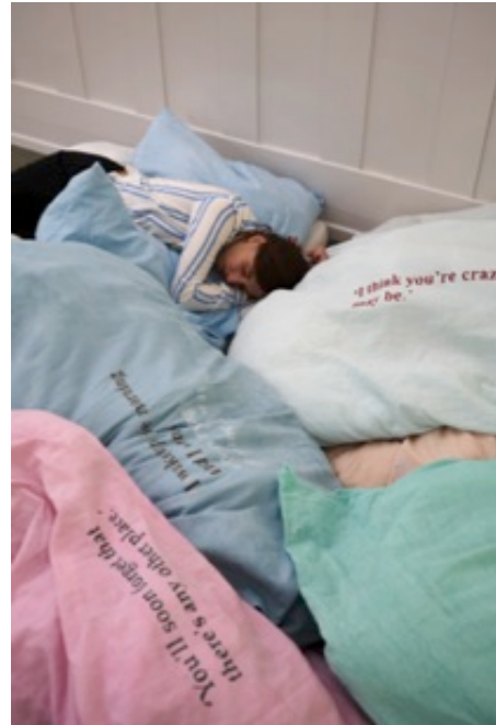
Lee Kit, My pillow seems like a bed... 2008, Acryl auf Stoff, 3 Matratzen, Video