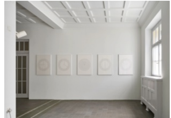
Matthias Liechti, 11:45 / 12:20 / target / 05:59 / 10:10 / 18:00 / 11:45 / 01:23 / target 2016/17, Graphit auf Papier, je 90 x 63 cm