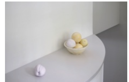
Ways to display fruits , 2013, Gips,