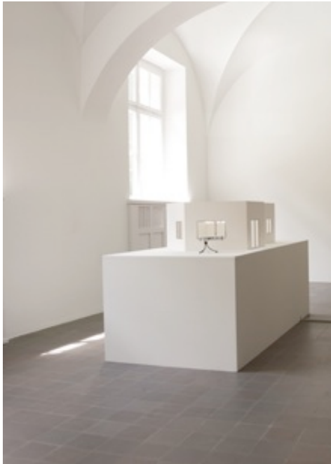
Zilla Leutenegger, Flat 2011, Architekturmodell mit Originalzeichnung und Video