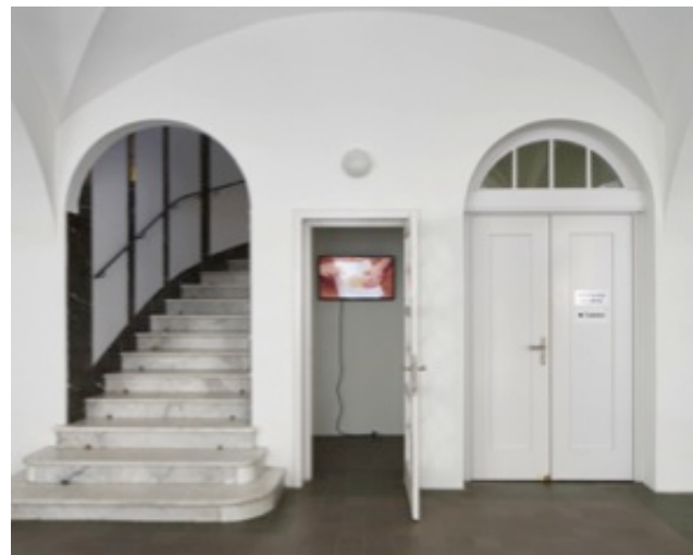
How to cut butter into a perfect cube , 2013, Video 7 Min.