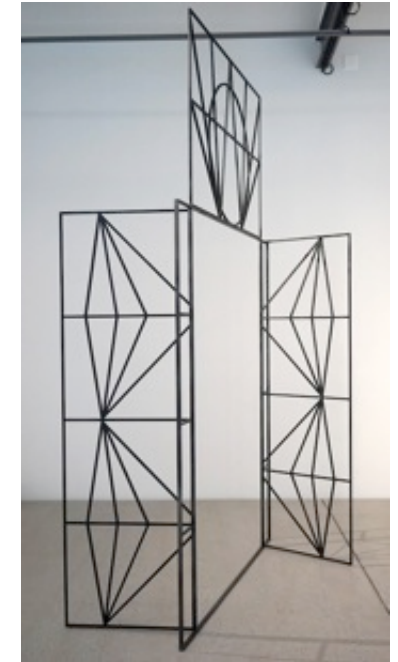
Boris Rebetez, Portail 2017, Stahl 302 x 142 x 140 cm