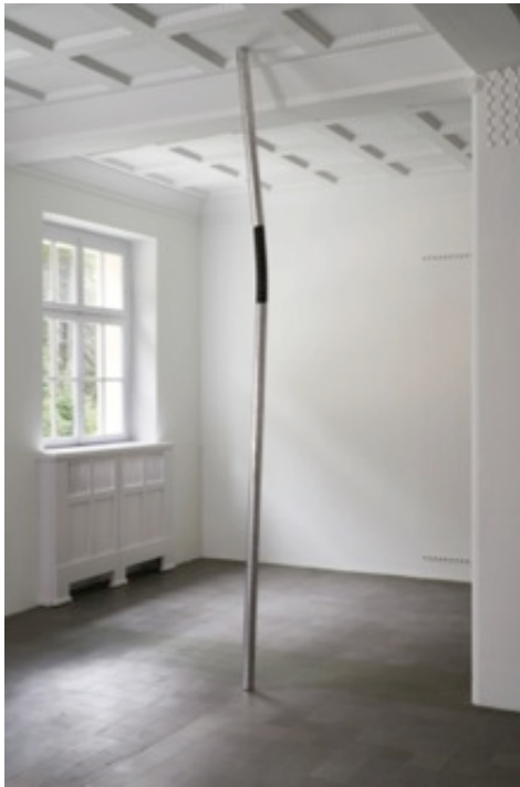
Judith Fegerl, (Untitled), Fitting 2017, Aluminiumrohr, Sprungfeder 310 x 6 cm