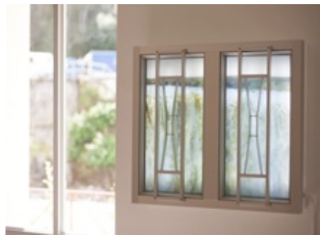
Nadim Abbas, Cataract, (Victoria Falls) 2010/17, Leuchtkästen, 70 x 80 x 10 cm