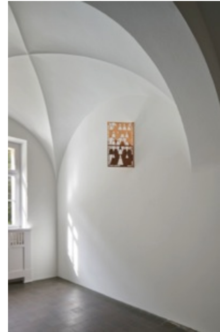
Boris Rebetez, Small window 2017, Kupfer poliert 69 x 40 x 0.4 cm