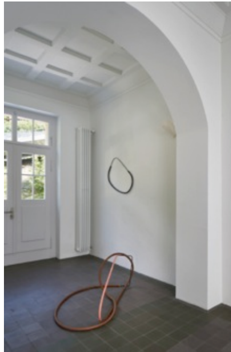
Beat Feller Tarasp , 2017, 47 x 120 x 56 cm Devrim , 2005, 58 x 78 cm