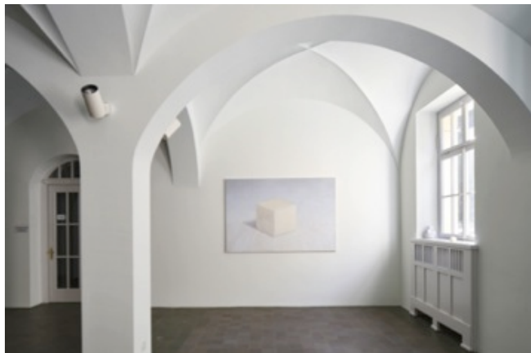
Sarah Lai, Milky yellow cube , 2013, Acryl/Leinen, 122 x 181 cm Plastik